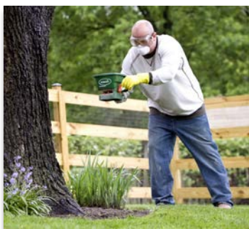
Fertilizers should be applied only to target spot.

Apply fertilizers and pesticide at minimum application rates and follow manufacturer's recommendations for safe use and disposal. Use these guidelines to help prevent stormwater pollution: