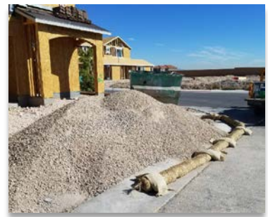
Wattles can effectively prevent discharging of landscape material.

Landscape sand, rock and other materials should be placed within the site being landscaped. This will prevent it from discharging anywhere off site in the event of rain or high winds. If landscape materials are placed in the street, best management practices need to be implemented to prevent materials from discharging off-site. Materials placed in the street should not be in the street for more than 24 hours, and the street should be swept after the material is removed. If rain is expected in the forecast, proper best management practices should be put in place to prevent stormwater runoff from carrying landscape materials into the storm drain.